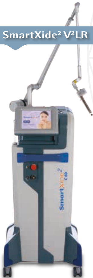
SmartXide 2 V 2 LR