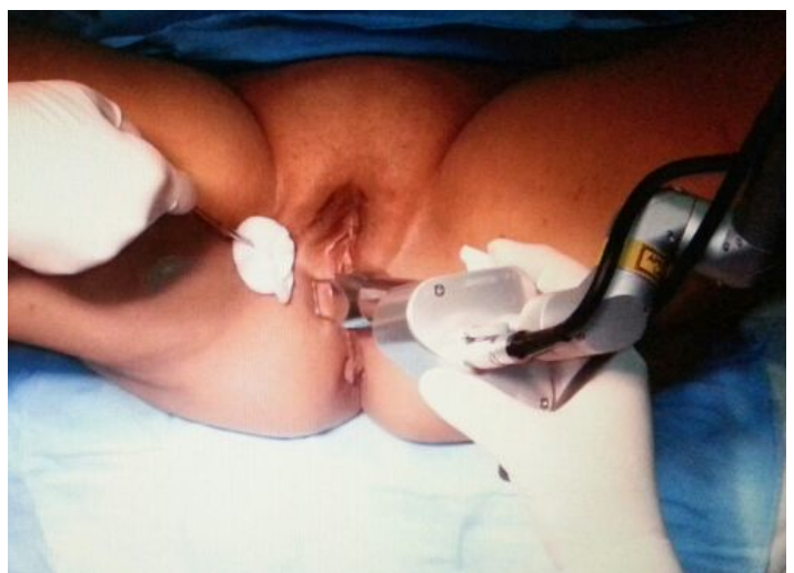
Fig. 4: MonaLisa Touch™ treatment for lichen sclero-atrophic