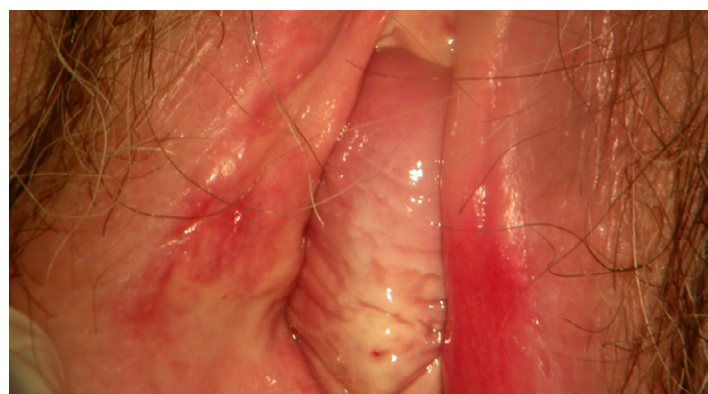
Fig. 2: Lichen sclerosus